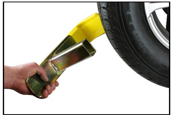
2. Position inner arm behind wheel, hook into rim.