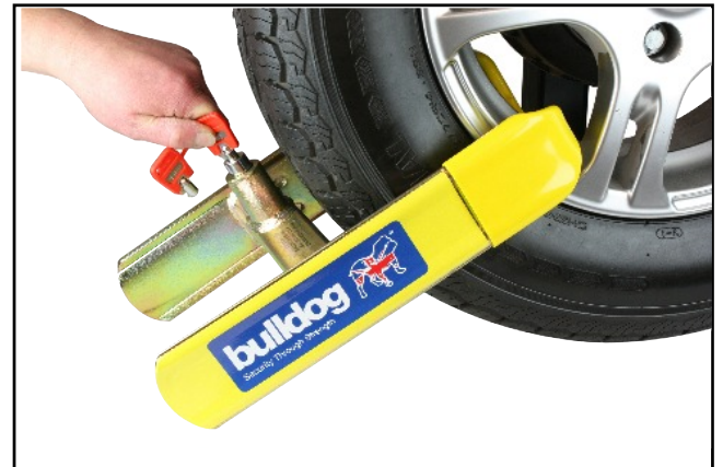
4. To remove clamp, insert key, rotate 1/2 turn, pull on key and/or press inner and outer arms together until lock pops out.

We have taken every care in the design and manufacture of this security device and we believe that it is an effective deterrent. However we cannot guarantee that it will resist the efforts of the most determined thief, and as such we do not accept any liability for loss or damage caused by theft, vandalism or other illegal activity against property to which this device is fitted.