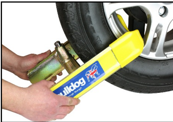
3. Slide inner and outer arms together, ensuring pointed outer arm fits into recess or hole in wheel, and push lock into nearest hole.